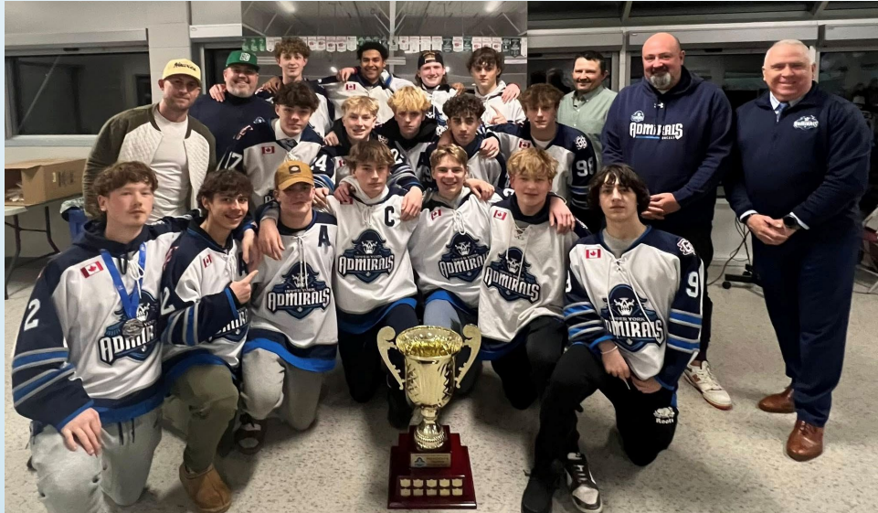
President's Award: U16AA